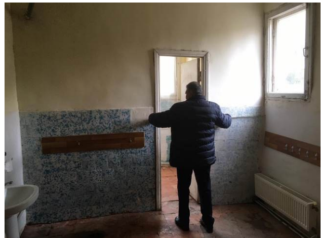
Work on measuring the old toilet of kindergarten